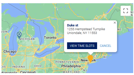
MAPS ARE AVAILABLE FROM BOTH THE RIS CLIENT AND PORTALS

Locations Near: 2 Test Drive Walkerville, MI 49459 US